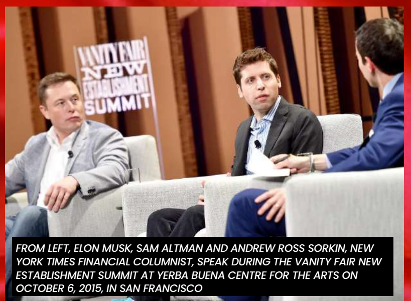
FROM LEFT, ELON MUSK, SAM ALTMAN AND ANDREW ROSS SORKIN, NEW YORK TIMES FINANCIAL COLUMNIST, SPEAK DURING THE VANITY FAIR NEW ESTABLISHMENT SUMMIT AT YERBA BUENA CENTRE FOR THE ARTS ON OCTOBER 6, 2015, IN SAN FRANCISCO