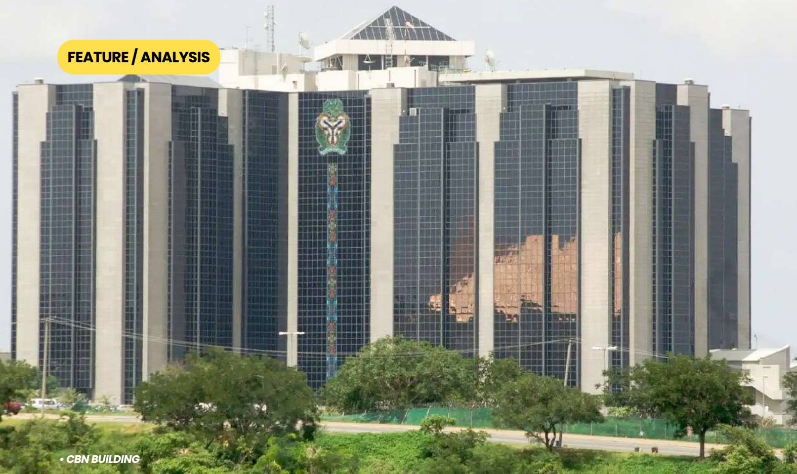
• CBN BUILDING