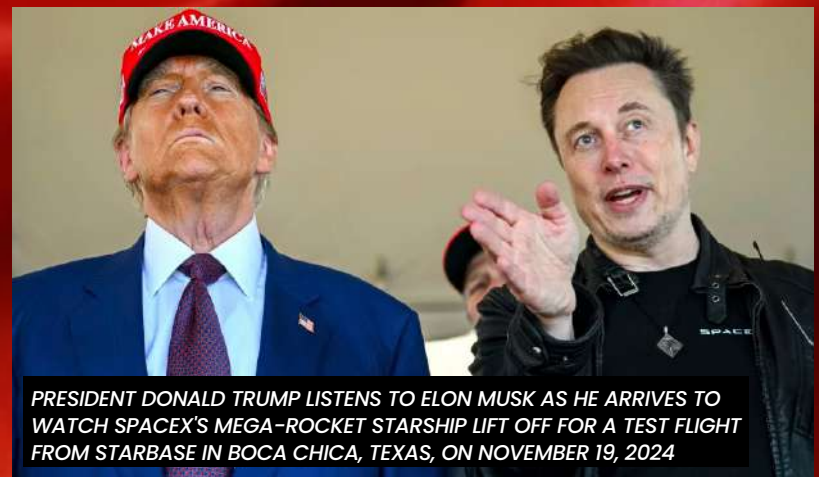
PRESIDENT DONALD TRUMP LISTENS TO ELON MUSK AS HE ARRIVES TO WATCH SPACEX'S MEGA-ROCKET STARSHIP LIFT OFF FOR A TEST FLIGHT FROM STARBASE IN BOCA CHICA, TEXAS, ON NOVEMBER 19, 2024