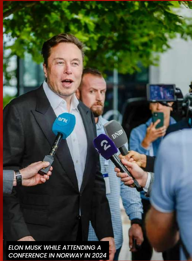
ELON MUSK WHILE ATTENDING A CONFERENCE IN NORWAY IN 2024