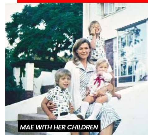
MAE WITH HER CHILDREN

As a young girl, Mae moved with her family to South Africa, where she pursued a career in modelling at the age of 15. Despite her early success, Mae's life took a challenging turn when she married Errol Musk, an engineer. The