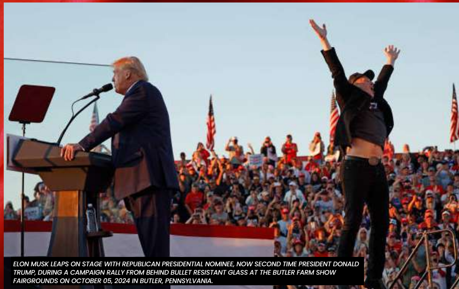
ELON MUSK LEAPS ON STAGE WITH REPUBLICAN PRESIDENTIAL NOMINEE, NOW SECOND TIME PRESIDENT DONALD TRUMP, DURING A CAMPAIGN RALLY FROM BEHIND BULLET RESISTANT GLASS AT THE BUTLER FARM SHOW FAIRGROUNDS ON OCTOBER 05, 2024 IN BUTLER, PENNSYLVANIA.