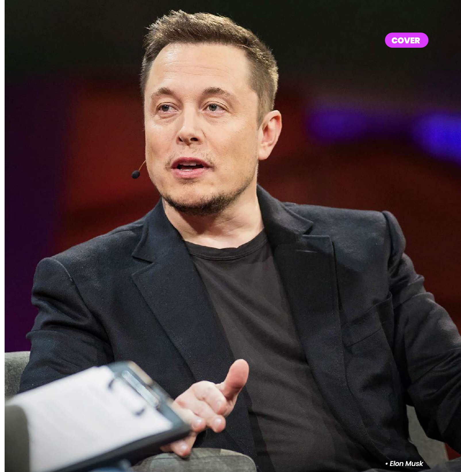
• Elon Musk

Musk's ambitions extend beyond terrestrial boundaries. He proposed the Hyperloop transportation system in 2013 and co-founded Neuralink in 2016, a