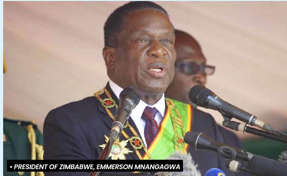
• PRESIDENT OF ZIMBABWE, EMMERSON MNANGAGWA