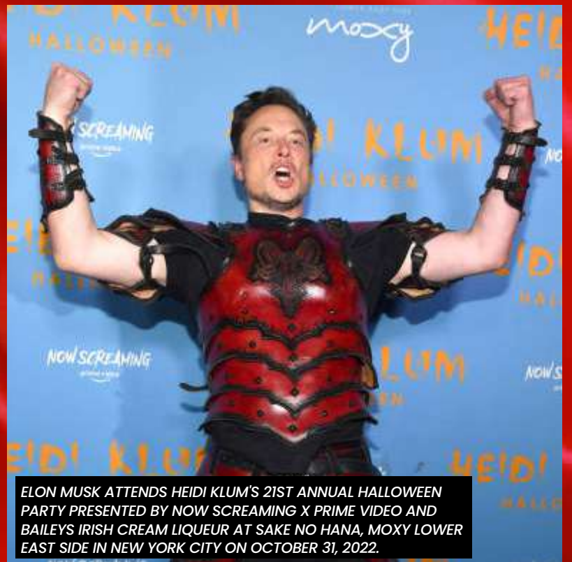
ELON MUSK ATTENDS HEIDI KLUM'S 21ST ANNUAL HALLOWEEN PARTY PRESENTED BY NOW SCREAMING X PRIME VIDEO AND BAILEYS IRISH CREAM LIQUEUR AT SAKE NO HANA, MOXY LOWER EAST SIDE IN NEW YORK CITY ON OCTOBER 31, 2022.