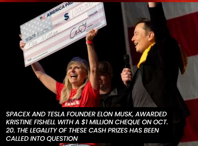
SPACEX AND TESLA FOUNDER ELON MUSK, AWARDED KRISTINE FISHELL WITH A $1 MILLION CHEQUE ON OCT. 20. THE LEGALITY OF THESE CASH PRIZES HAS BEEN CALLED INTO QUESTION