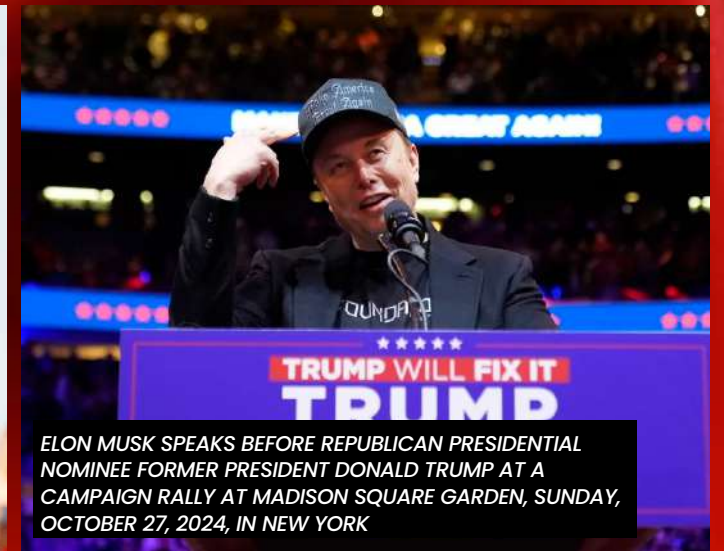
ELON MUSK SPEAKS BEFORE REPUBLICAN PRESIDENTIAL NOMINEE FORMER PRESIDENT DONALD TRUMP AT A CAMPAIGN RALLY AT MADISON SQUARE GARDEN, SUNDAY, OCTOBER 27, 2024, IN NEW YORK