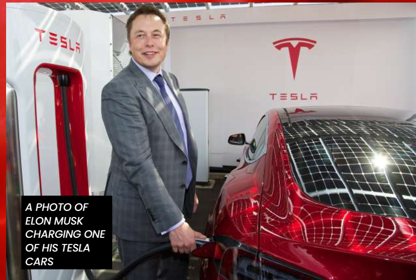
A PHOTO OF ELON MUSK CHARGING ONE OF HIS TESLA CARS