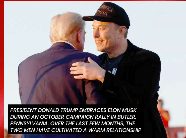
PRESIDENT DONALD TRUMP EMBRACES ELON MUSK DURING AN OCTOBER CAMPAIGN RALLY IN BUTLER, PENNSYLVANIA. OVER THE LAST FEW MONTHS, THE TWO MEN HAVE CULTIVATED A WARM RELATIONSHIP