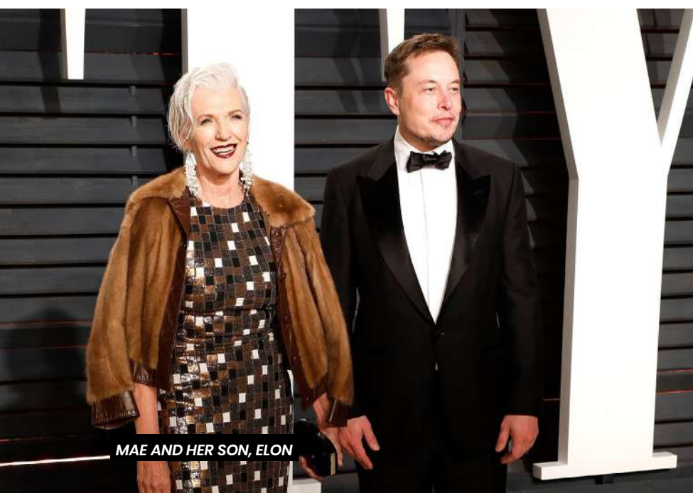
MAE AND HER SON, ELON