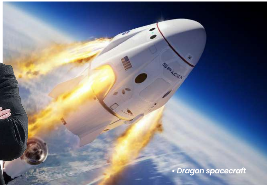
• Dragon spacecraft