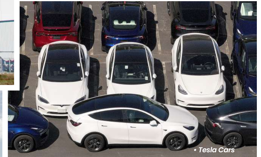
• Tesla Cars