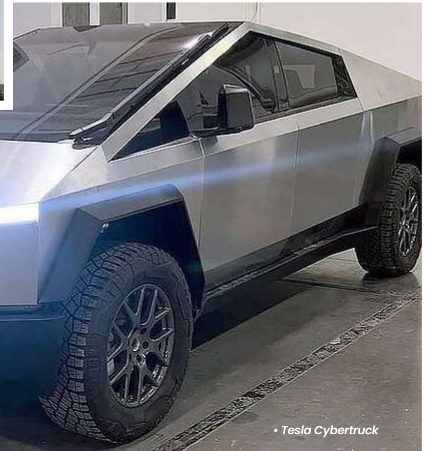
• Tesla Cybertruck