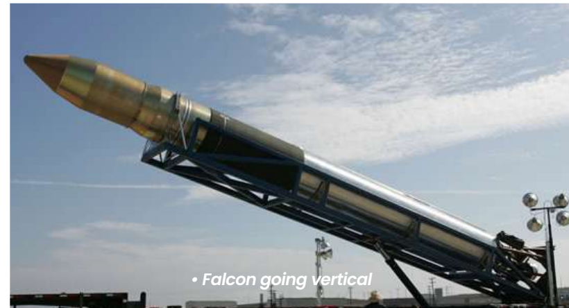
• Falcon going vertical