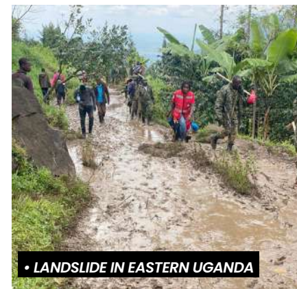
• LANDSLIDE IN EASTERN UGANDA

Anti-government protesters and law officers clashed in various sites throughout Mozambique on Wednesday, November 27, marking another fatal round of protests.