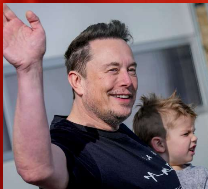
WITH HIS SON IN ONE ARM, TESLA CEO, ELON MUSK, WAVES WHILE VISITING THE TESLA GIGAFACTORY IN GERMANY.