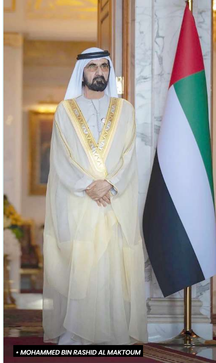
• MOHAMMED BIN RASHID AL MAKTOUM

A journalist interviewed the founder of Dubai in the United Arab Emirates, Sheikh Mohammed Bin Rashid Al Maktoum, about his country's future. He replied: "My grandfather rode a camel. My father rode a camel. I drive a Mercedes. My son drives a Land Rover. And, my grandson will drive a Land Rover but my great-grandson will have to ride a camel again..."