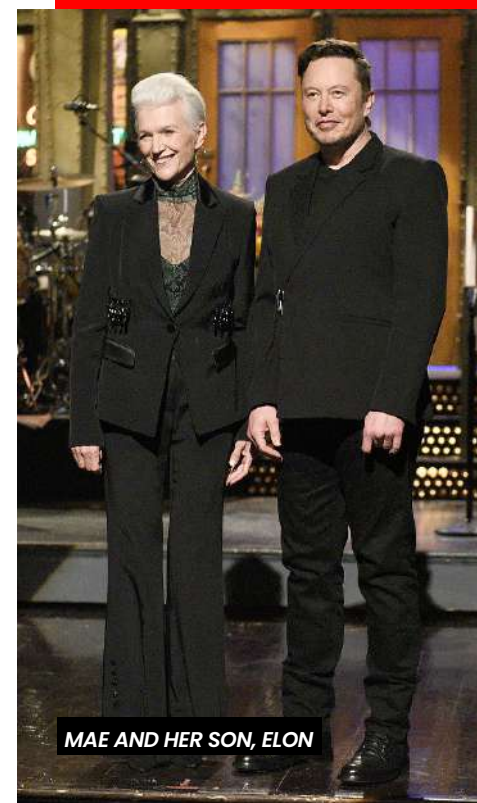
MAE AND HER SON, ELON

marriage produced three exceptional children: Elon, Kimbal, and Tosca, but also came with its share of struggles, leading to a divorce in 1979.