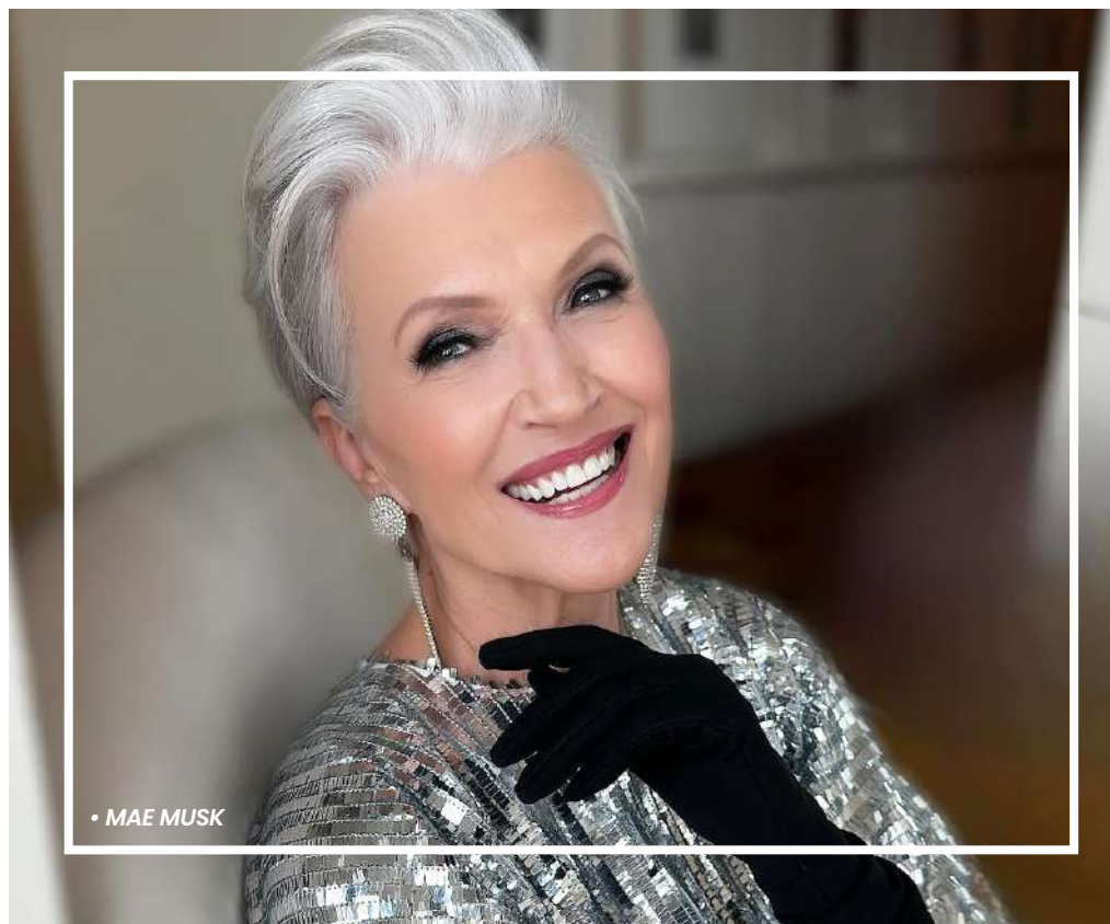
• MAE MUSK

B ehind every great success lies a story of resilience, determination, and unwavering support. For Elon Musk, the world-renowned entrepreneur and richest man on earth, that story begins with his mother, Mae Musk. But Mae's influence goes far beyond being the matriarch of a billionaire family - her journey is a testament to the power of grit, reinvention, and boundless ambition.