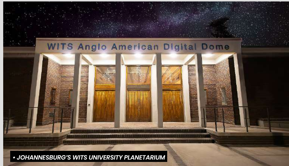
• JOHANNESBURG'S WITS UNIVERSITY PLANETARIUM