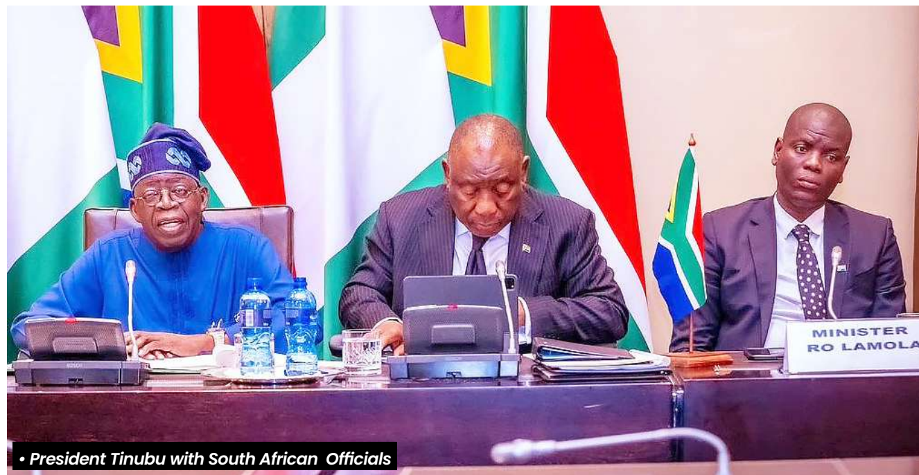
• President Tinubu with South African Officials