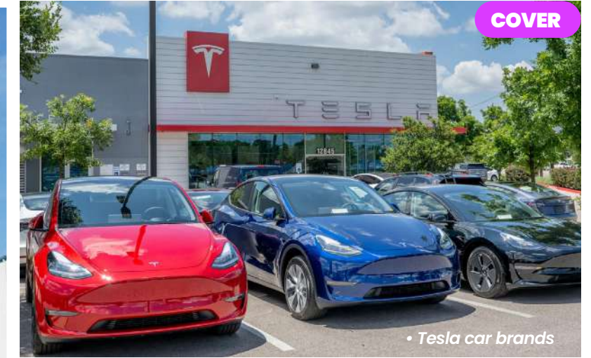
• Tesla car brands